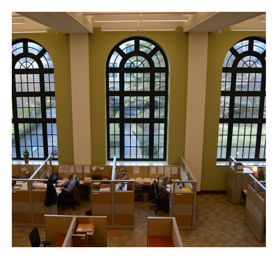
The Historic Courthouse, which was built in the 1920s, is home to the DA's Office.