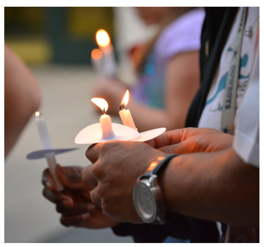
Family and friends of murder victims participate in the National Day of Remembrance of Murder Victims vigil Sept. 25, 2013, at the Charlotte-Mecklenburg Police Department.